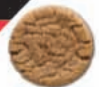
Snickerdoodle Item # 44005