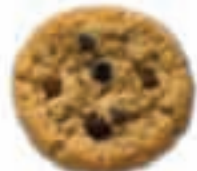
Oatmeal Raisin Item # 44016