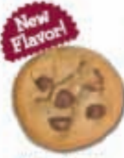
Peanut Butter Cep Cookie Item # 44098