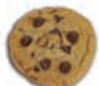
Chocolate Chip Item # 44010