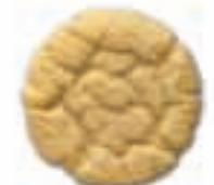
Sugar Cookie Item # 44017