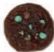
Chocolate Mint Chip Item # 44099