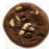
Double Chocolate Brownie Item # 44099