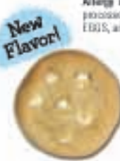
Lemon Cookies Item # 44099