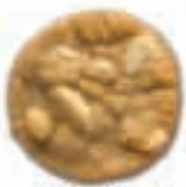
White Chunk Macadamia Nut Item # 44097