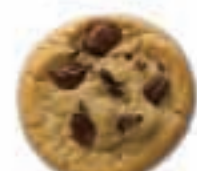
Chocolate Chunk Item # 44012