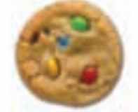
Candy Cookie with M&M's® Candies Item # 44019