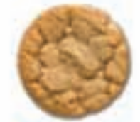
Peanut Butter Item # 44018